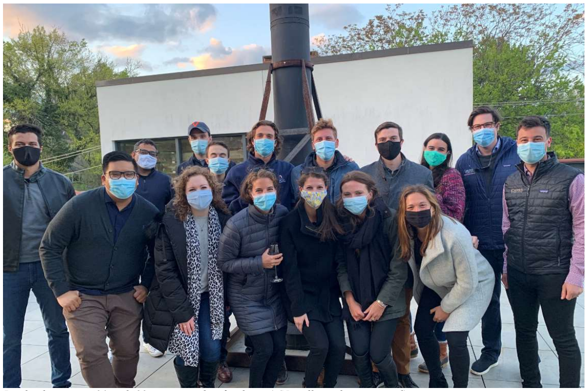
Leadership teams '21 and '22 come together for dinner! (Not all members pictured)