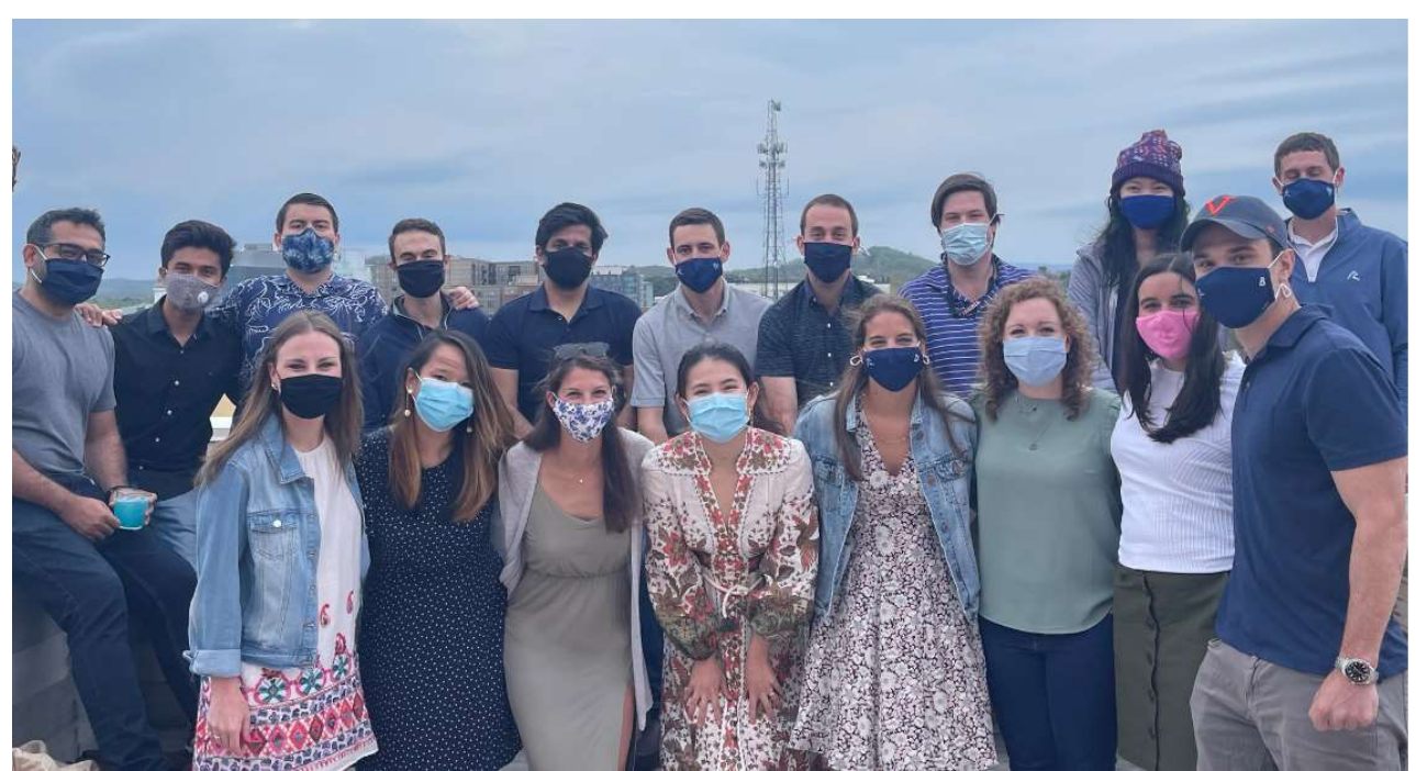
Photo from our first in-person SY class event in April (not all 24 members pictured)